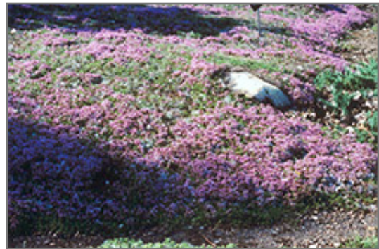
Mother-of-Thyme in bloom