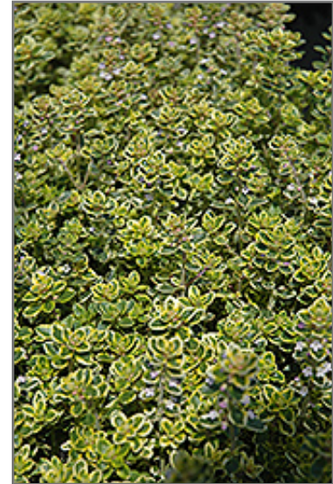
Lemon Thyme foliage

Lemon Thyme is smothered in stunning spikes of lilac purple flowers rising above the foliage from early to late summer. Its attractive tiny fragrant round leaves remain light green in color throughout the year.