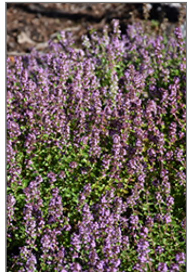
Lemon Thyme flowers