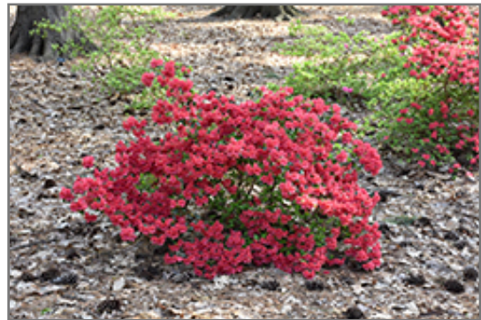
Girard's Crimson Azalea in bloom