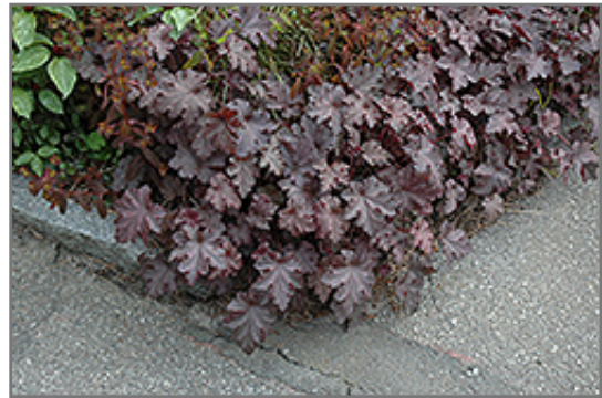
Stormy Seas Coral Bells

Stormy Seas Coral Bells is recommended for the following landscape applications;