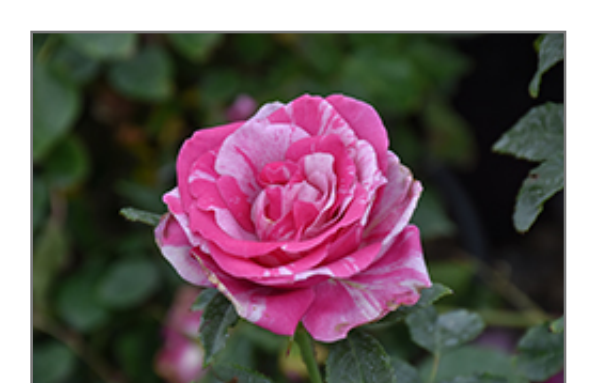
Parade Day Rose flowers

Columbus Garden Center - 1156 Oakland Park Avenue, Columbus, OH 43224-3317 Phone: 614-268-3511 Fax: 614-784-7700 Delaware Garden Center - 25 Kilbourne Road, Delaware, OH 43015 Phone: 740-548-6633 Fax: 740-363-2091 Dublin Garden Center - 4261 West Dublin-Granville Road, Dublin, Ohio 43017 Phone: 614-874-2400 Fax: 614-874-2420 New Albany Garden Center - 5211 Johnstown Rd, New Albany, Ohio 43054 Phone: 614-917-1020 Fax: 614-917-1023