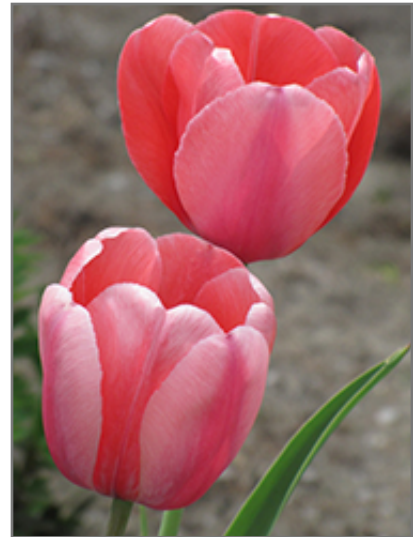
Pink Impression Tulip flowers