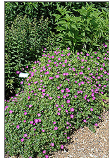
Max Frei Cranesbill in bloom