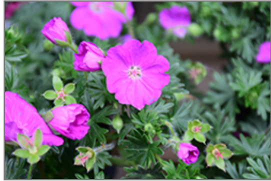
Max Frei Cranesbill flowers

Max Frei Cranesbill is a fine choice for the garden, but it is also a good selection for planting in outdoor pots and containers. It is often used as a 'filler' in the 'spiller-thriller-filler' container combination, providing a mass of flowers against which the thriller plants stand out. Note that when growing plants in outdoor containers and baskets, they may require more frequent waterings than they would in the yard or garden.