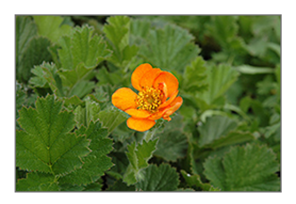
Fireball Avens flowers