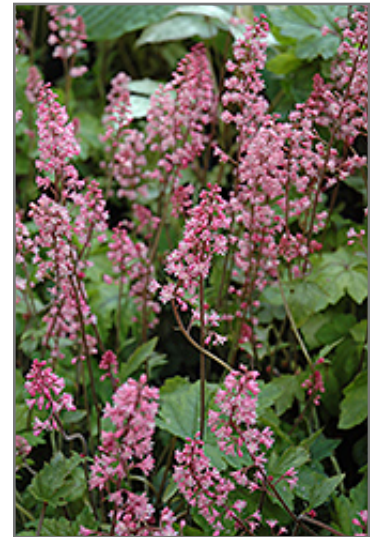
Dayglow Pink Foamy Bells flowers

This is a relatively low maintenance plant, and is best cleaned up in early spring before it resumes active growth for the season. It is a good choice for attracting hummingbirds to your yard. It has no significant negative characteristics.