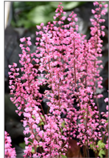
Dayglow Pink Foamy Bells flowers

Dayglow Pink Foamy Bells is a fine choice for the garden, but it is also a good selection for planting in outdoor pots and containers. It is often used as a 'filler' in the 'spiller-thriller-filler' container combination, providing a mass of flowers and foliage against which the larger thriller plants stand out. Note that when growing plants in outdoor containers and baskets, they may require more frequent waterings than they would in the yard or garden.