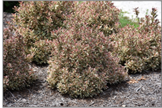
My Monet Weigela

My Monet Weigela makes a fine choice for the outdoor landscape, but it is also well-suited for use in outdoor pots and containers. It is often used as a 'filler' in the 'spiller-thriller-filler' container combination, providing a mass of flowers and foliage against which the thriller plants stand out. Note that when grown in a container, it may not perform exactly as indicated on the tag - this is to be expected. Also note that when growing plants in outdoor containers and baskets, they may require more frequent waterings than they would in the yard or garden.