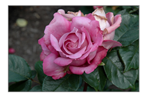
Royal Amethyst Rose flowers

Columbus Garden Center - 1156 Oakland Park Avenue, Columbus, OH 43224-3317 Phone: 614-268-3511 Fax: 614-784-7700 Delaware Garden Center - 25 Kilbourne Road, Delaware, OH 43015 Phone: 740-548-6633 Fax: 740-363-2091 Dublin Garden Center - 4261 West Dublin-Granville Road, Dublin, Ohio 43017 Phone: 614-874-2400 Fax: 614-874-2420 New Albany Garden Center - 5211 Johnstown Rd, New Albany, Ohio 43054 Phone: 614-917-1020 Fax: 614-917-1023