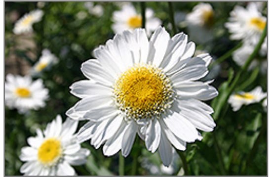
Sunny Side Up Shasta Daisy flowers

An outstanding shasta daisy with large white semi blooms with golden centers; blooms are very large and the white petals vary in length to add interest; a beautiful addition to the garden when massed; hardy and blooms throughout the summer