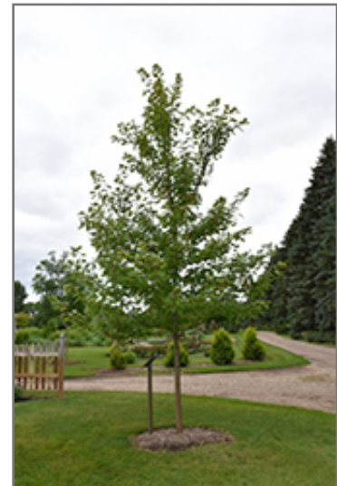
Matador Maple