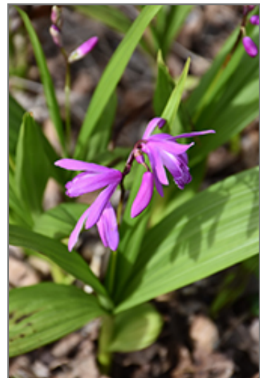
Lavender Japanese Hyacinth Orchid flowers