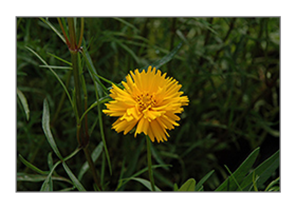
Sundancer Tickseed flowers

Compact plant with cheery, double daisy-like yellow flowers; tolerant of pests and drier soils; thriving in sandy and rocky soils; coreopsis needs good drainage