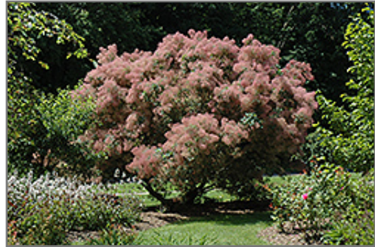
Grace Smokebush in bloom

Grace Smokebush is recommended for the following landscape applications;