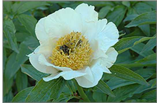
Halcyon Tree Peony flowers

Halcyon Tree Peony will grow to be about 5 feet tall at maturity, with a spread of 5 feet. It has a low canopy, and is suitable for planting under power lines. It grows at a slow rate, and under ideal conditions can be expected to live for approximately 20 years.