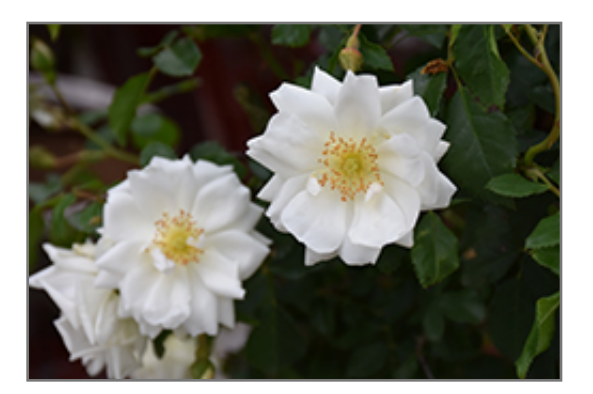
Flower Carpet White Rose flowers