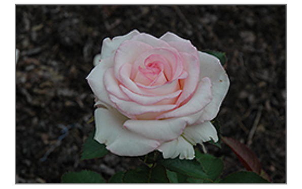
Moonstone Rose flowers

Moonstone Rose is a multi-stemmed deciduous shrub with an upright spreading habit of growth. Its average texture blends into the landscape, but can be balanced by one or two finer or coarser trees or shrubs for an effective composition.