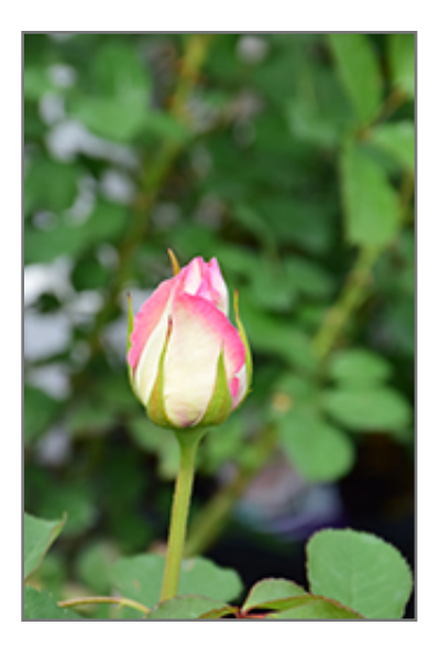
Moonstone Rose flower buds

This shrub will require occasional maintenance and upkeep, and is best pruned in late winter once the threat of extreme cold has passed. It is a good choice for attracting bees to your yard. It has no significant negative characteristics.