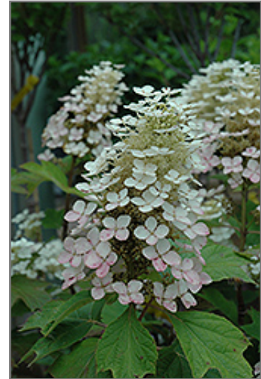
Alice Hydrangea flowers

Alice Hydrangea is recommended for the following landscape applications;