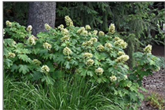
Alice Hydrangea in bloom