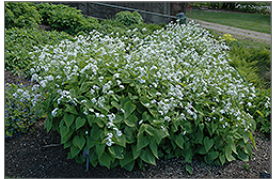
Perennial Money Plant in bloom

Perennial Money Plant is recommended for the following landscape applications;