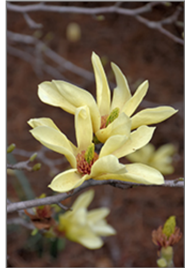
Yellow Bird Magnolia flowers