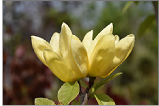
Yellow Bird Magnolia flowers

This tree does best in full sun to partial shade. It requires an evenly moist well-drained soil for optimal growth, but will die in standing water. It is not particular as to soil type, but has a definite preference for acidic soils. It is quite intolerant of urban pollution, therefore inner city or urban streetside plantings are best avoided. Consider applying a thick mulch around the root zone in winter to protect it in exposed locations or colder microclimates. This particular variety is an interspecific hybrid.