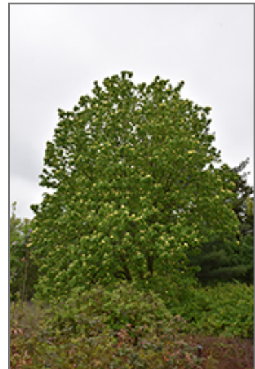
Yellow Bird Magnolia in bloom