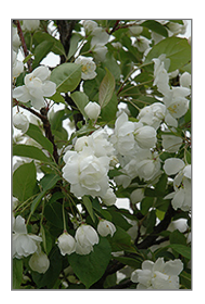
Madonna Flowering Crab flowers