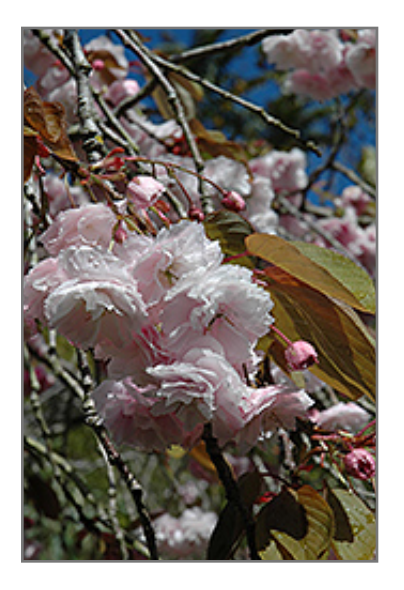
White Flowering Cherry flowers